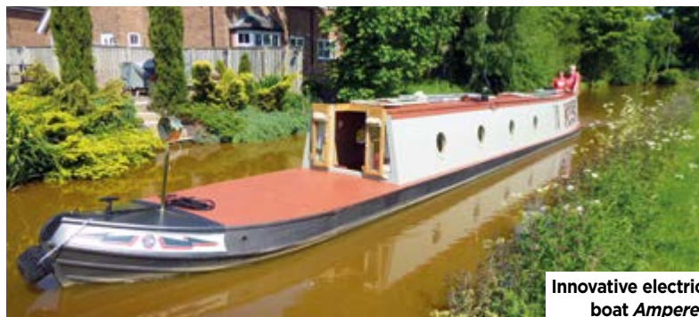
Innovative electric boat Ampere .

- Willow is a 22ft by 7ft 6in Viking 22 with a trailer and a Evinrude 15hp outboard petrol engine. It's priced £12,995 and has had a number of recent improvements including new batteries, canopy water system, cassette toilet and fenders.