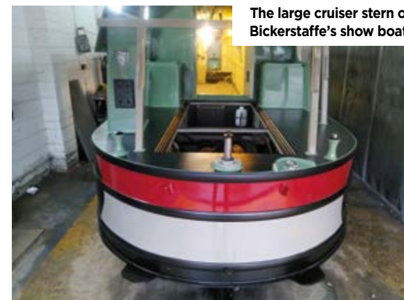
The large cruiser stern of Bickerstaffe's show boat.