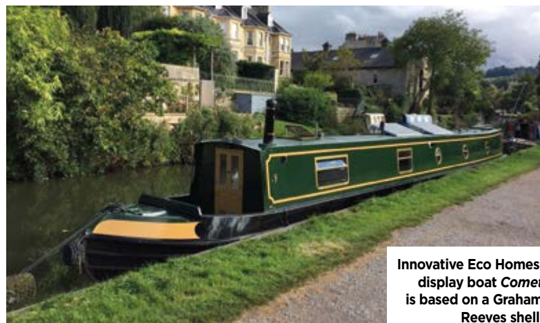
Innovative Eco Homes' display boat Comet is based on a Graham Reeves shell.

Based on a 57ft Graham Reeves shell, Comet is a two-berth narrowboat powered by a Beta 43 engine. Inside, the boat is finished in an array of contrasting colours and materials, giving it a homely, rustic feel. It features underfloor heating, a Morso Squirrel stove, gold-plated thermostatic bathroom taps, LED lighting and USB charging ports.