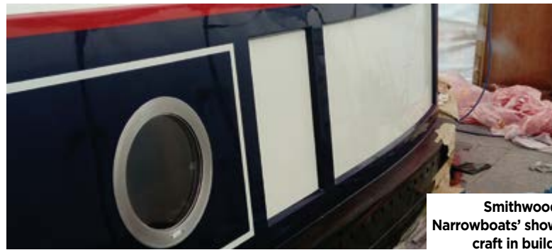
Smithwood Narrowboats' show craft in build.

NB A 58ft narrowboat on a Tim Tyler semi-trad Josher-style shell, fitted out to the highest standards with solid oak carpentry and a modern interior. It boasts an automatic Pullman dinette, quartz floors and worktops, a Reflex diesel stove and Webasto central heating. It's powered by a 42hp Canaline engine, and has a bow-thruster and electric ballast adjustment.