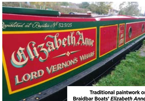
Traditional paintwork on Braidbar Boats' Elizabeth Anne.

Based by Bridge 15 on the Macclesfield Canal, Braidbar Boats has been building narrowboats for more than 30 years. Producing just seven luxury boats each year, the company takes particular pride in its interior craftsmanship, which it describes as "traditional and timeless". Braidbar actively encourages people to meet the team, see how they work and discuss their ideas.