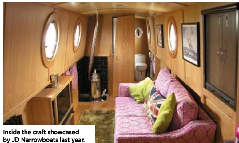
Inside the craft showcased by JD Narrowboats last year.

- Nottingham Boat Co will also be showcasing a new boat for the first time. The 60ft by 12ft wide-beam barge was designed using CAD, has sleek lines making it easy to manoeuvre and will be displayed as a sailaway.