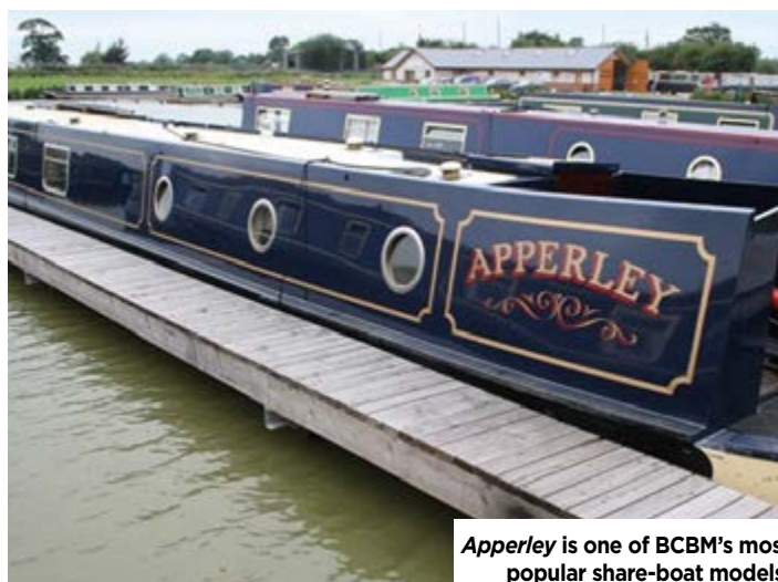
Apperley is one of BCBM’s most popular share-boat models.

Apperley is a 58ft six-berth semi-trad narrowboat, purpose built for BCBM’s boat-share scheme. The newly painted craft is installed with a Beta 43 engine, has central heating plus a stove, and is fully equipped for cruising.