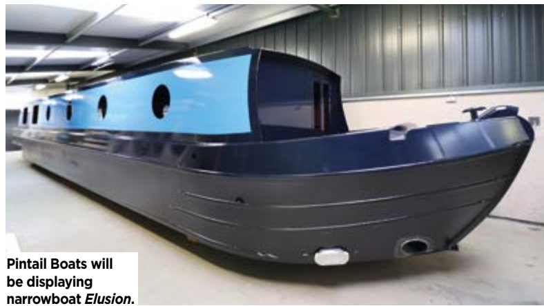
Pintail Boats will be displaying narrowboat Elusion .

WB Elusion is a 54ft by 9ft 3in slim wide-beam with a cruiser stern. It has been designed and built for the luxury canal-boat holiday market and being only slightly wider than a standard narrowboat means it's easy to handle on the water – helped by the Vetus bow-thruster. There's space for up to six people to sleep on board, with king-sized beds that easily convert into singles, and there are two bathrooms. The interior is fitted with oak below the gunwales, with cream paintwork above, and a selection of portholes and hopper windows keep the space light and airy.