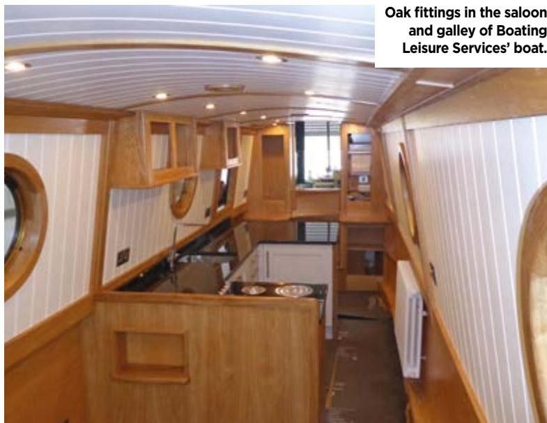
Oak fittings in the saloon and galley of Boating Leisure Services' boat.