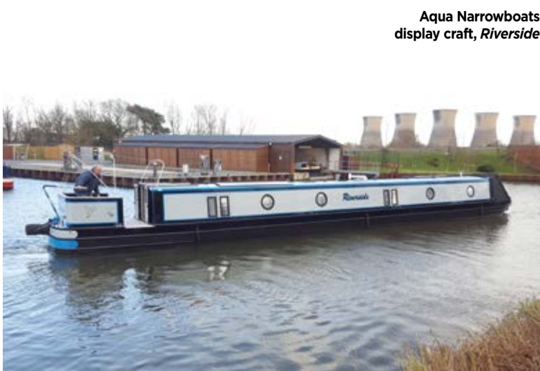
Aqua Narrowboats’ display craft, Riverside .

Riverside is a 65ft bespoke cruiser stern narrowboat with four berths and a Beta 50 engine. It boasts a large, square transom rear deck, double-