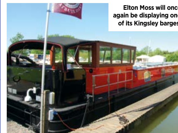
Elton Moss will once again be displaying one of its Kingsley barges.

- A 65ft cruiser stern narrowboat that sleeps up to six, with a walk-through tiled bathroom and two bedrooms. The interior is fully painted and boasts Italian stone worktops. It also has solar panels and wifi.