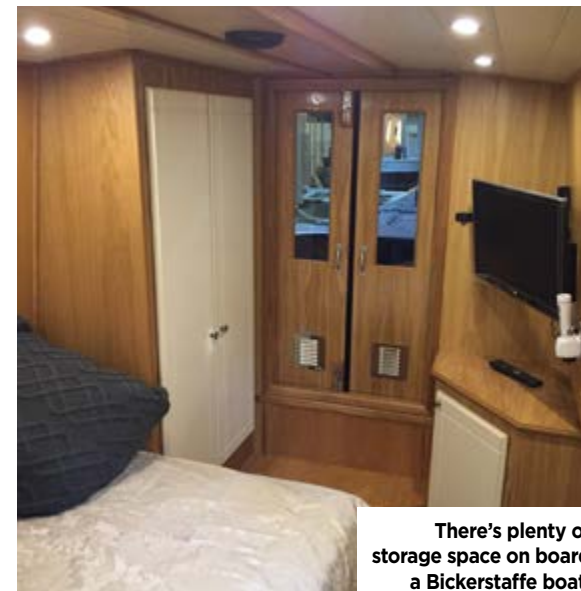
There's plenty of storage space on board a Bickerstaffe boat.