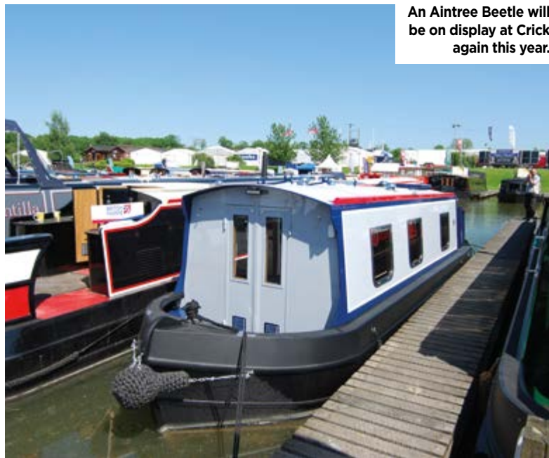
An Aintree Beetle will be on display at Crick again this year.