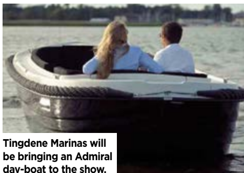
Tingdene Marinas will be bringing an Admiral day-boat to the show.

- An Admiral open day-boat requiring minimal maintenance and powered by a Mariner outboard.