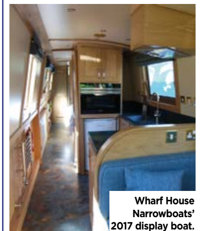
Wharf House Narrowboats' 2017 display boat.

NB A 48ft semi-trad narrowboat with a reverse layout and fully fitted interior with oak trims. It's powered by a Beta 38 engine and has the added benefit of a bow-thruster.