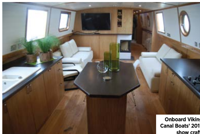
Onboard Viking Canal Boats' 2017 show craft.