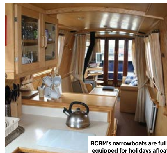
BCBM’s narrowboats are fully equipped for holidays afloat.