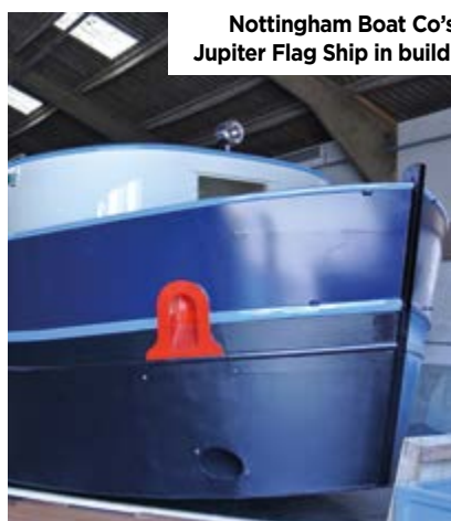
Nottingham Boat Co's Jupiter Flag Ship in build.

- The Jupiter Flag Ship barge is a four-berth 70ft by 12ft wide-beam powered by a Vetus 80hp engine. It boasts a hardwood wheelhouse and three Webasto BlueSky electric sliding roof hatches. The luxurious fit-out includes slate grey worktops in the galley, a dual-purpose office space with a Rock n Rolla sofa-bed and corner desk, and lots of under-gunwale and under-bed storage in the cabin.