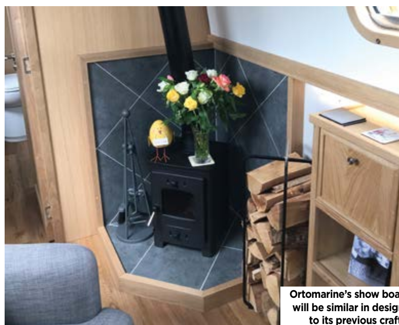
Ortomarine's show boat will be similar in design to its previous craft.

Two boats including the slim wide-beam Pioneer model (9ft beam).