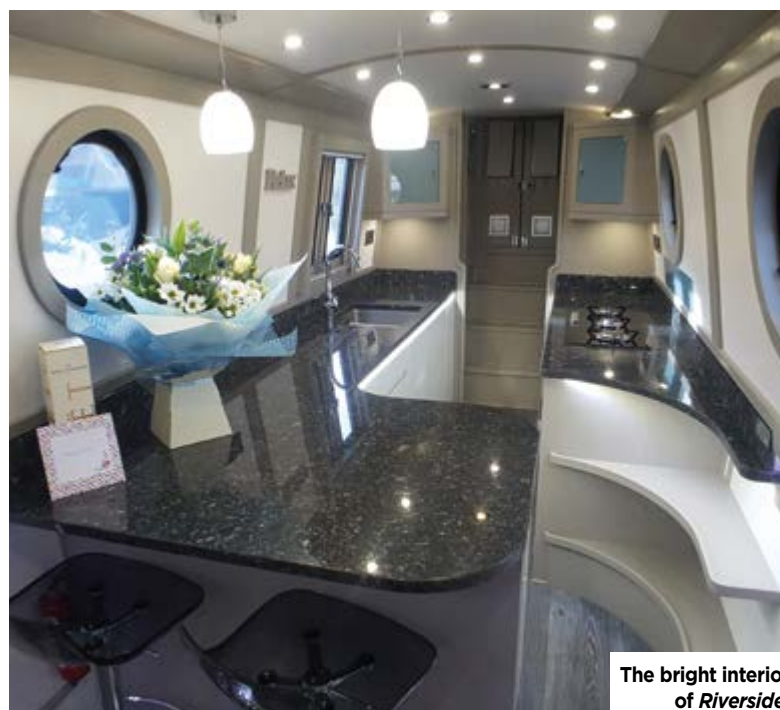
The bright interior of Riverside .

woodwork, and lots of reflective surfaces. It has a large galley with granite worktops and breakfast bar, a separate day room/study, king-sized crossbed and stainless steel radiators.